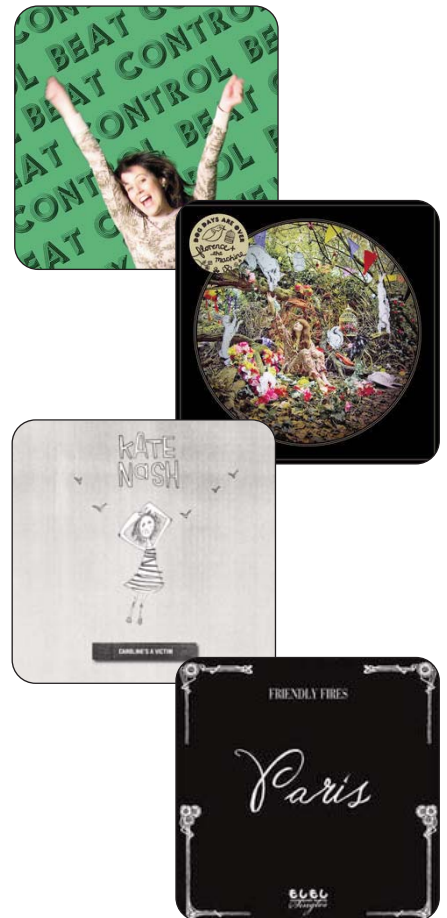
Some notable Moshi Moshi releases. From top: Tilly and the Wall Beat Control ; Florence and the Machine Days Are Over ; Kate Nash Caroline's A Victim ; Friendly Fires Paris

The label has also been hosting a night at Iceland Airwaves for the last five years and have thrown parties at the annual South By South West festival in Austin, Texas for a similar length of time. On top of this, Moshi Moshi nights can be found at events such as Camden Crawl and The Great Escape. This year the label has also taken over the booking for the Saturday at Winterwell Festival in Gloucestershire in June.