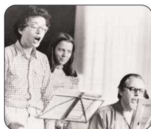
Rene Jacobs and Alfred Deller

recordings became key in establishing harmonia mundi as a force in music from these periods.