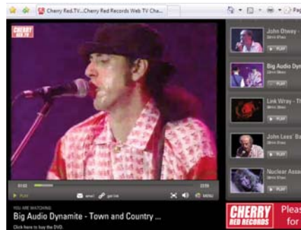
Big Audio Dynamite at the Town & Country Club on Cherryred.tv

7T's - launched to re-issue recordings from many famous names from the 1970s including Showaddywaddy, 10cc,