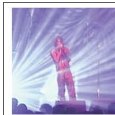
Hawkwind Silver Machine Prog Rock -